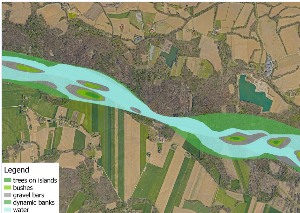
Figure 2: Representation of the target state near Apače.