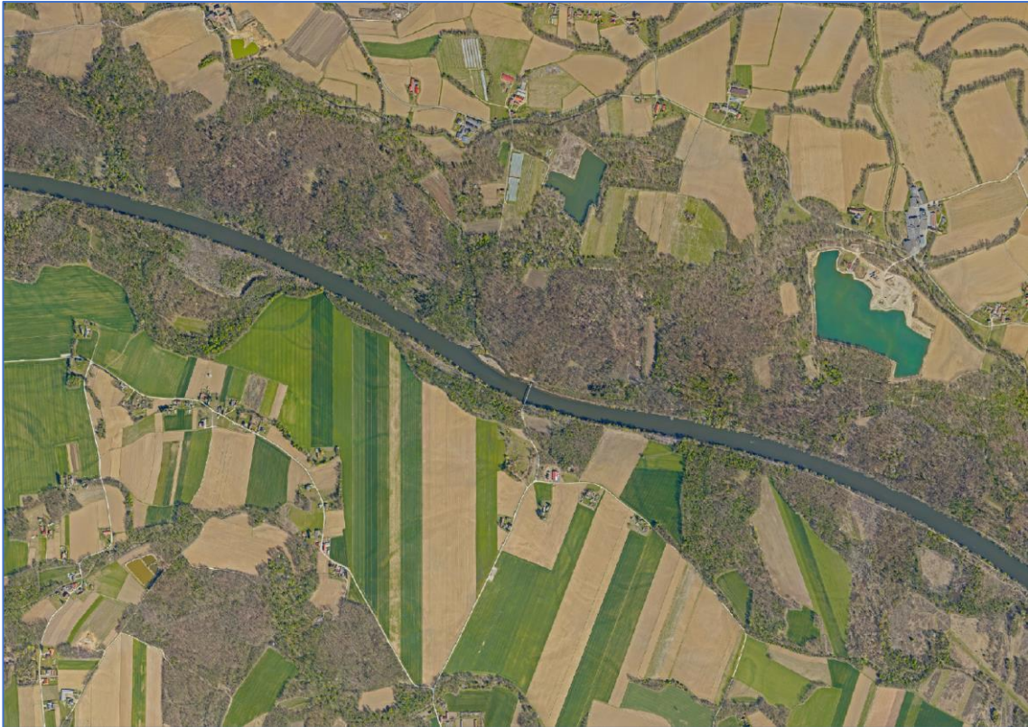
Figure 1: Depiction of the current state of the riverbed near Apače.