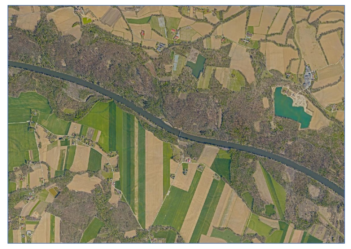
Figure 1: Depiction of the current state of the riverbed near Apače.