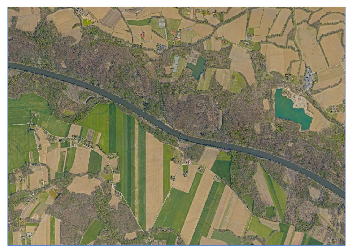
Figure 1: Depiction of the current state of the riverbed near Apače.